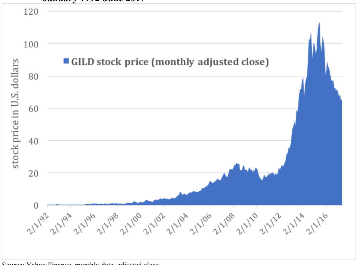
Figure 1. Gilead Sciences (GILD: NASDAQ) stock price (monthly adjusted close), January 1992-June 2017

Source: Yahoo Finance, monthly data, adjusted close.